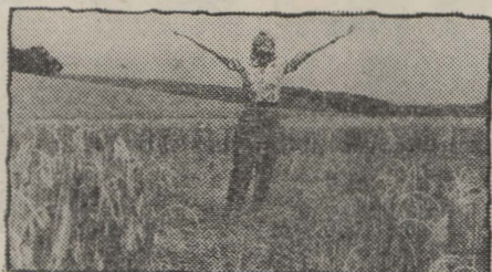
ROOK INVESTIGATES: EXPRESS, JULY 15, 1983