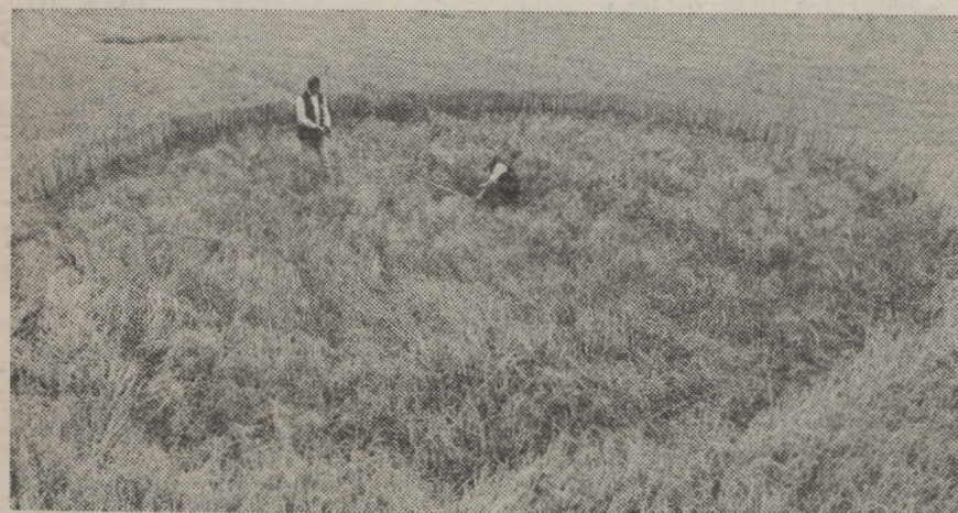
One of the circles yesterday